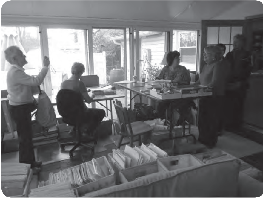
Members of the Writing Committee watch as envelopes containing exams from schools are opened and sorted.