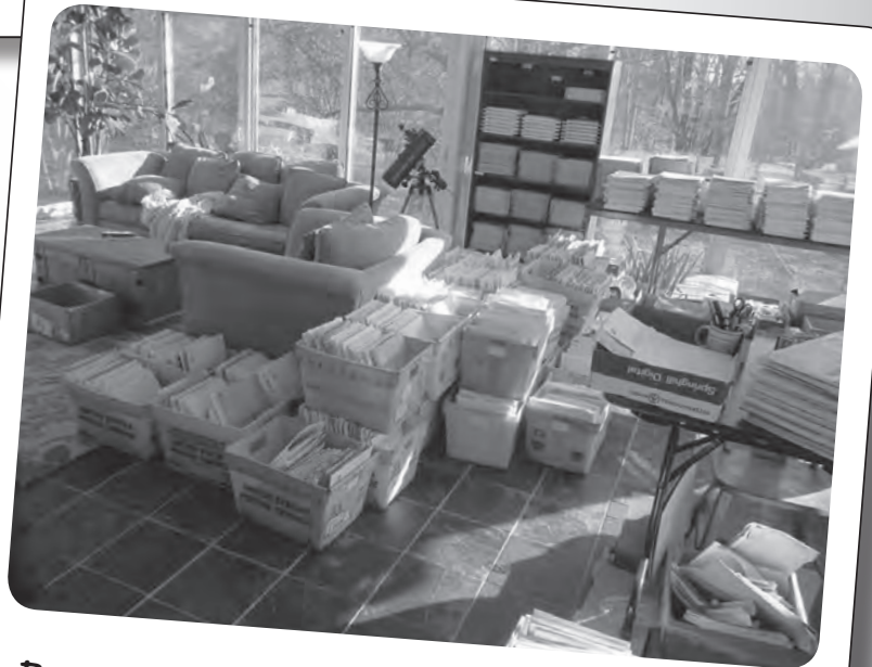
Boxes of the 2013 National Latin Exams waiting to be scanned.