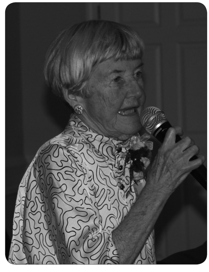
Speech! Speech! Speech!