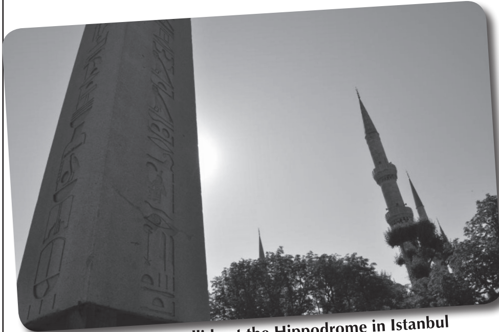
Centuries collide at the Hippodrome in Istanbul