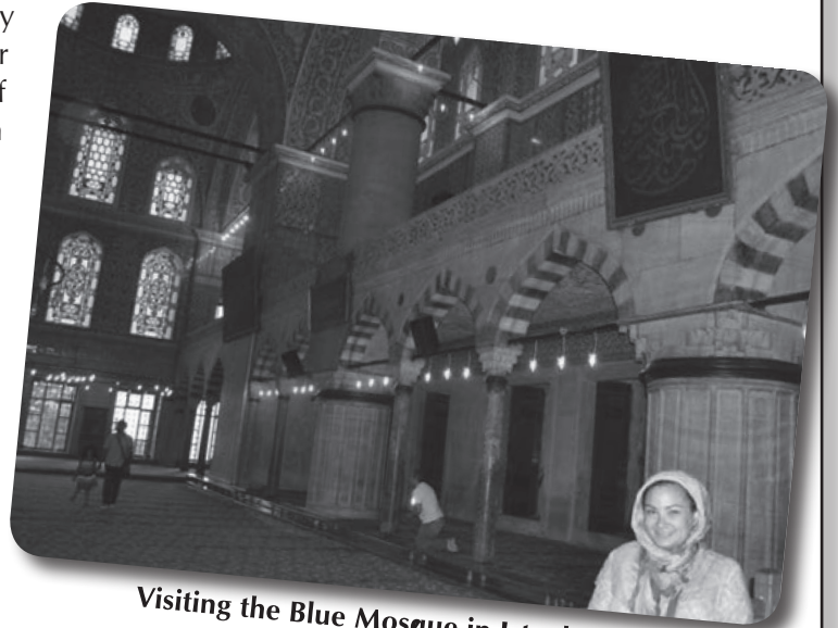
Visiting the Blue Mosque in Istanbul