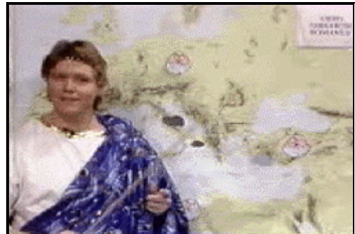
"In Britannia pluit, ut semper!"

Mare Adriaticum (Mare Superum) – Adriatic Sea Mare Aegaeum – Aegean Sea Mare Caspium – Caspian Sea Mare Internum (Mare Nostrum) – Mediterranean Sea Mare Tyrrhenum/ Mare Infernum - Tyrrhenian Sea Oceanus Atlanticus - Atlantic Ocean Pontus/ Pontus Euxinus/ Mare Ponticum - Black Sea Sinus Arabicus - Red Sea Sinus Persicus - Persian Gulf